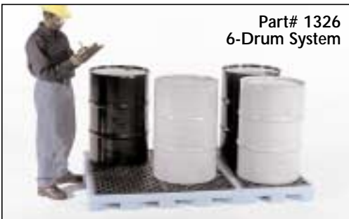
Part# 1326 6-Drum System